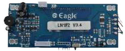
Eagle's precision - SMD PCB