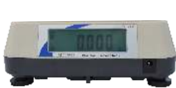
Jewel 110 - built in rear display