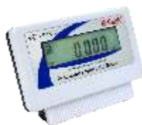
Jewel 120 - remote display