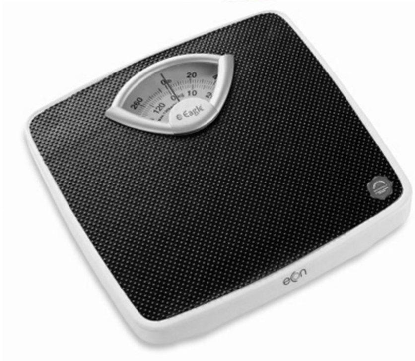
Figure- 1 Model

The said model is a spring and lever based mechanical non-automatic weighing instrument with a maximum capacity of 130kg and minimum capacity of 10kg. The verification scale interval (e) is 1kg. The pointer on the graduated dial indicates the results of the measurements. It is used as mechanical person weighing machine.